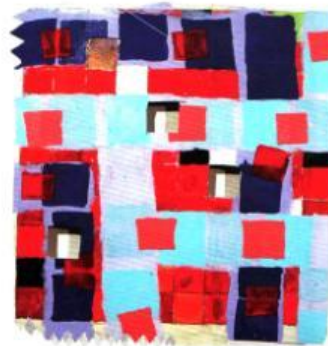
JAGGED LAYERS , 2010, ACRYLIC, ENAMEL, AND GRAPHITE ON GATORBOARD AND WOOD, 21 3/4 × 22 1/4 × 1 3/4 INCHES.