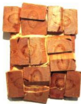
RAW CHIPS , 2008, GORILLA GLUE AND WOOD, 12 × 10 × 1 1/2 INCHES.