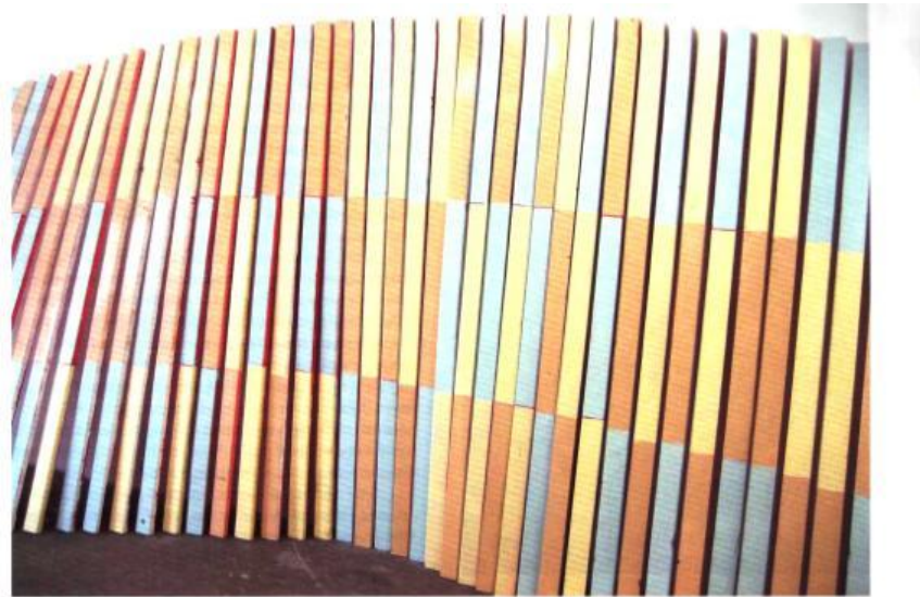
THIRD WAVE , 2008, ACRYLIC ON WOOD, 96 × 274 × 79 INCHES. (DIMENSIONS VARIABLE, UP TO 480 LINEAR INCHES).